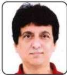
Mr. Sajid Nadiadwala President