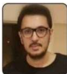
Mr. Dinesh Vijan